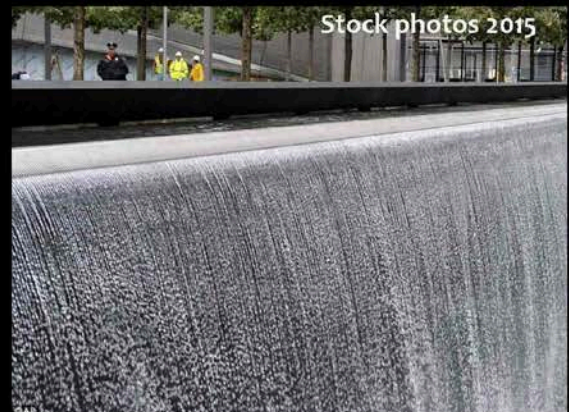
Stock photos 2015

A masterpiece of reflection is the black granite square where water walls flow on all four sides onto a flat wide rim continuing its flow towards a deep black hole in the center.