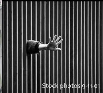
Stock photos 9-11-01